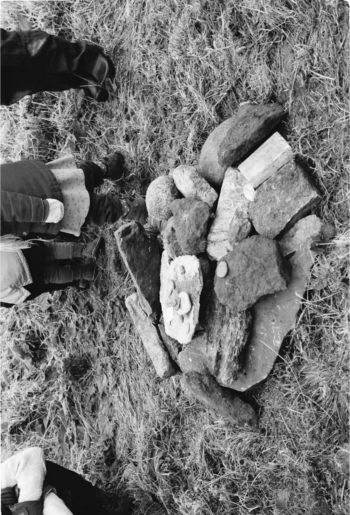
GRIEF IN THE CITY