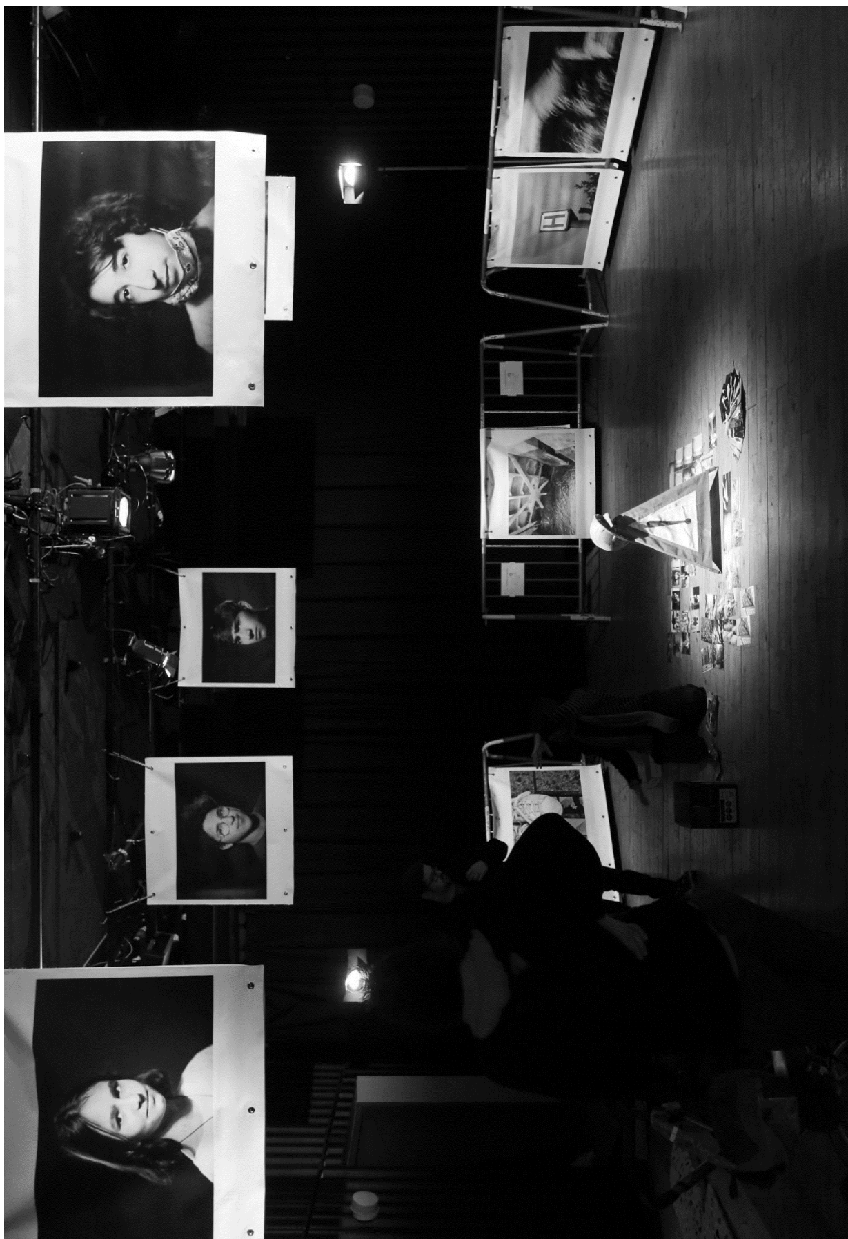
URBE URBANISME EMOTIONNEL