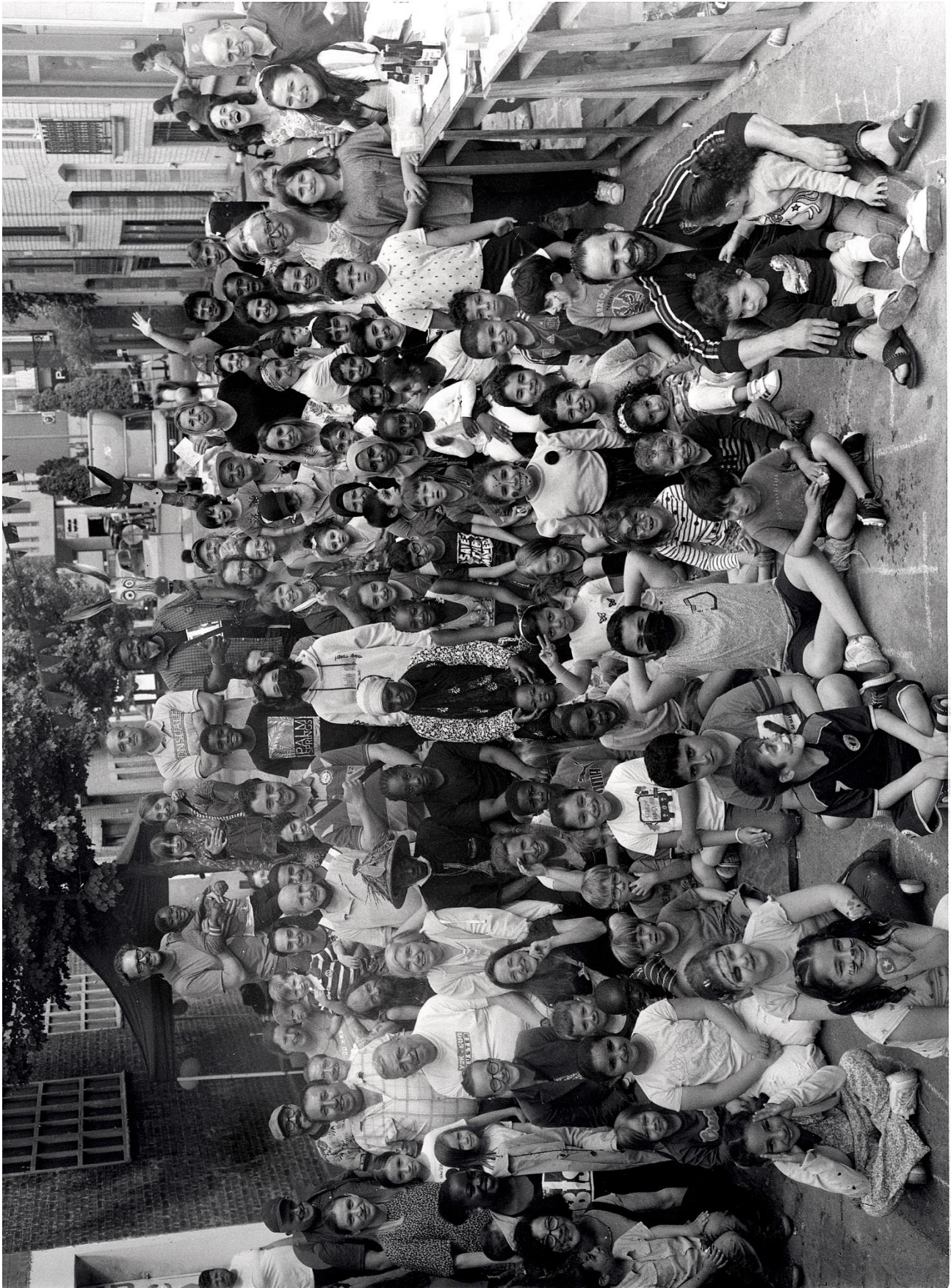
ARPENTAGE D'UN QUARTIER POPULAIRE