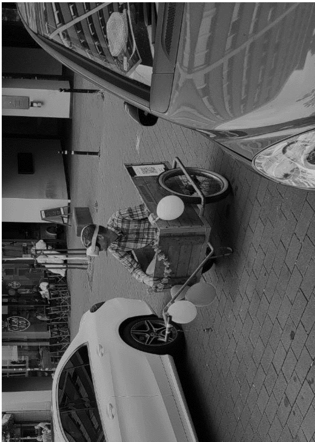
1984 IS NOW