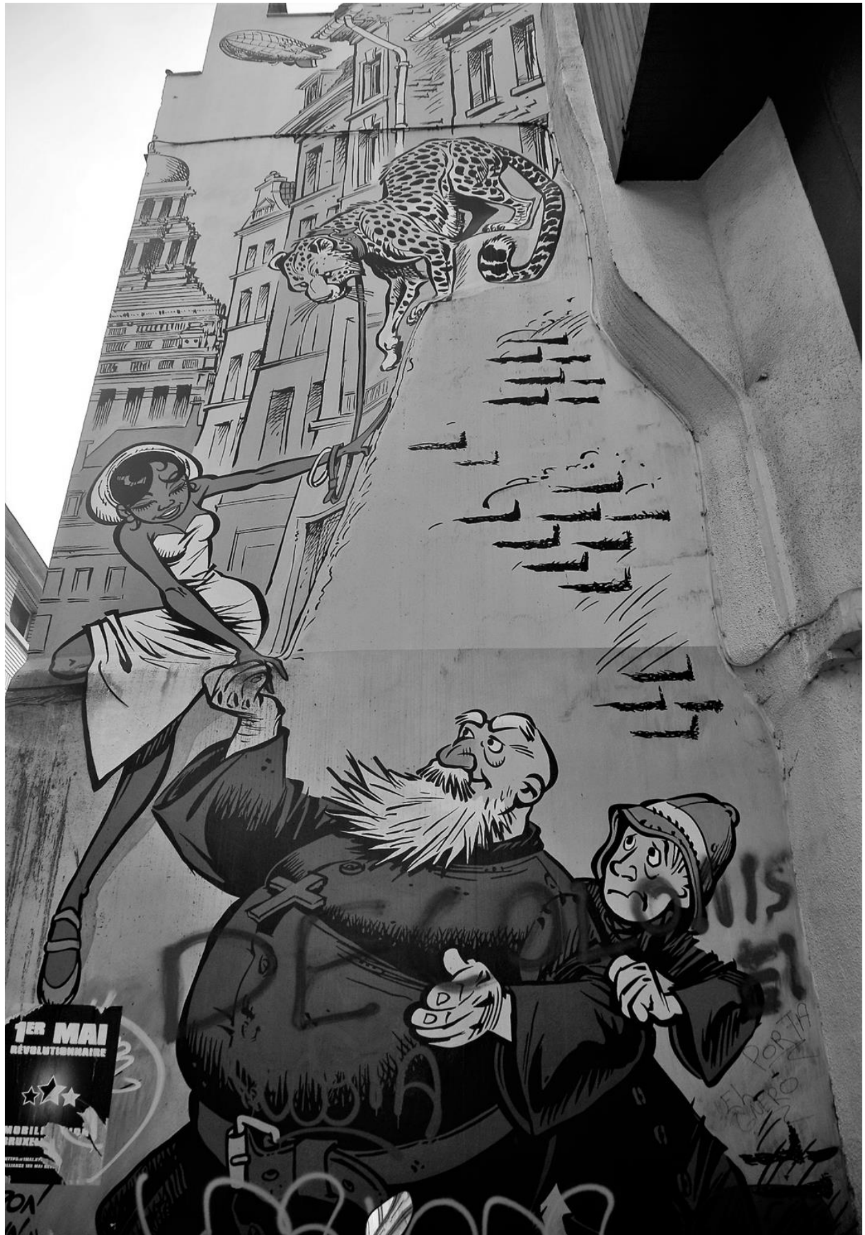
CONTESTED SYMBOLS IN PUBLIC SPACE