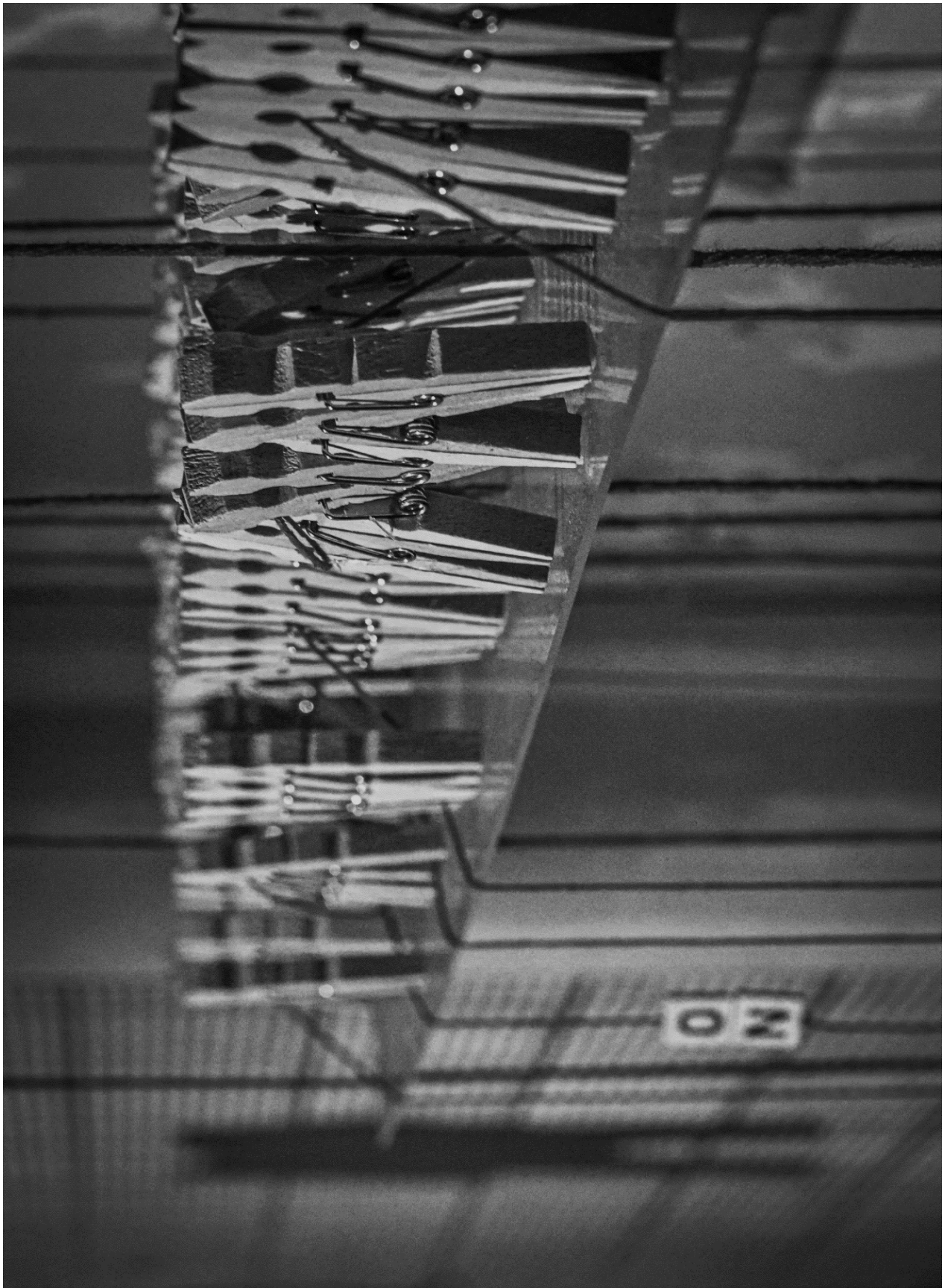
JUS SANGUINIS