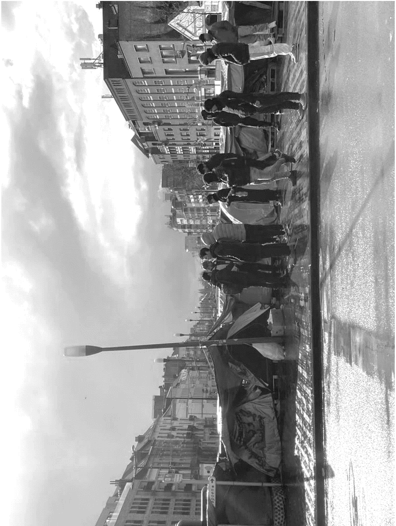
BRIDGE STORIES