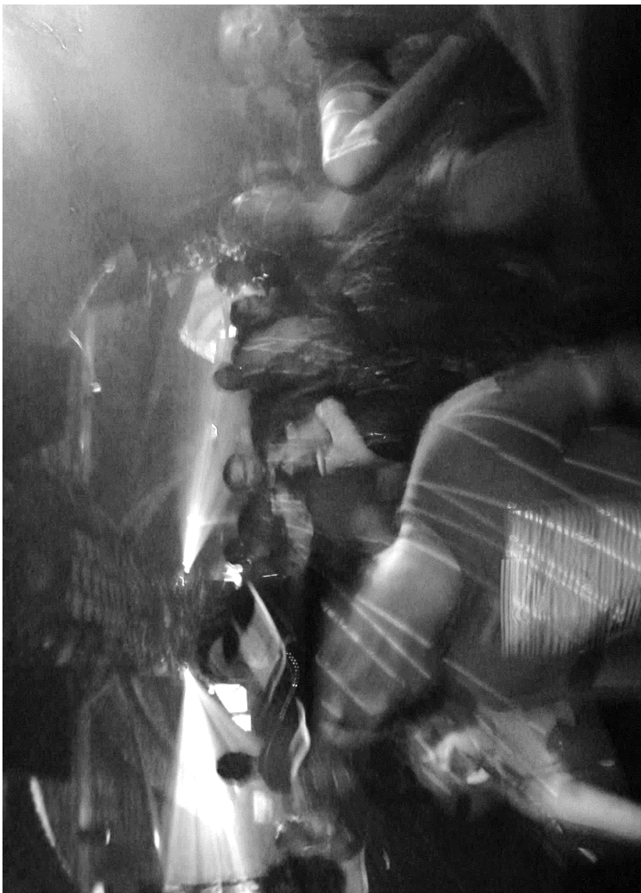
MIND THE NIGHT: LES NUITS DE DEMAIN